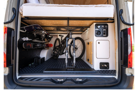
Bike Fork Mount