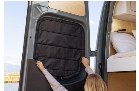
Magnetic Window Cover Full Set