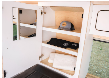
Spacious closet and floor-ceiling pull out pantry.