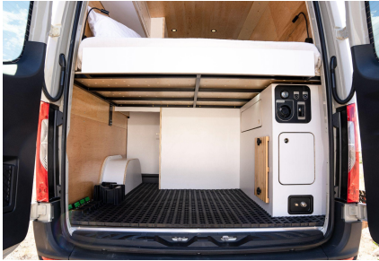
T-Mat Floor Storage System