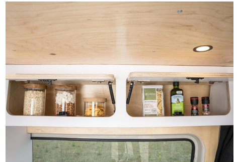
A total of four sleek and spacious overhead cabinets.