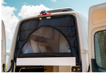
Rear Door Partition