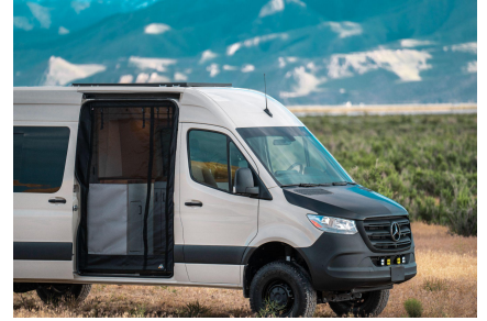
Slider Bug Screen