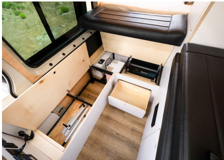
Ample storage for gear under the bench seat.