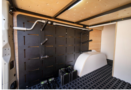
Pegboard Storage System