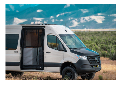
Slider Bug Screen