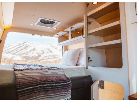
Spacious closet and four overhead cabinets

Ample storage for gear under the bench seat.