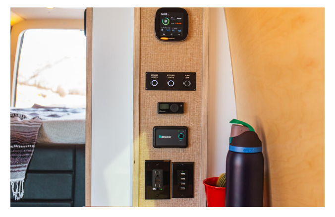
Advanced Tech Stack

The Allterra is equipped with an industry leading 40 gal freshwater tank and includes an quick-winterize system designed to make winter camping a breeze.