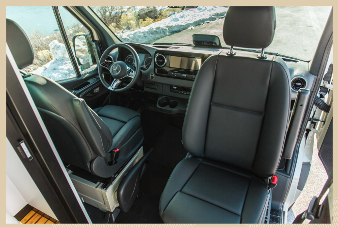
Passenger Seat Swivel

6-way adjustable table can be quickly removed and stowed under the bench seat.