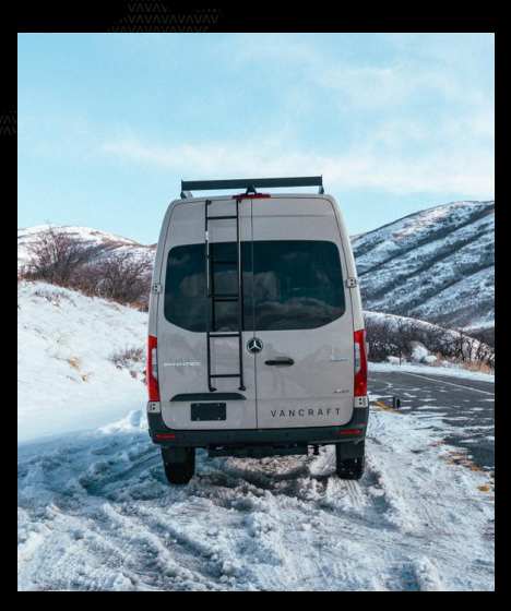
Rear door ladder and tow package; 5,000 lb tow rating.