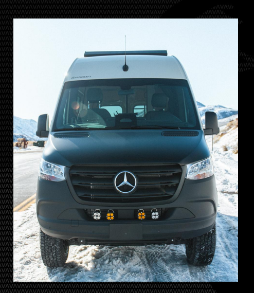
Protective matte black hood wrap and a two-tone light pod kit.