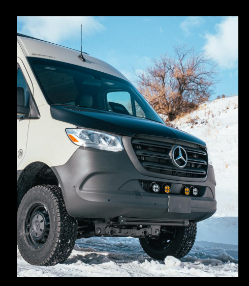
Matte black wheels wrapped in 32" all-terrain Yokohama tires.