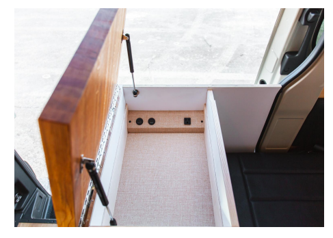
End table storage has been optimized for your electronics