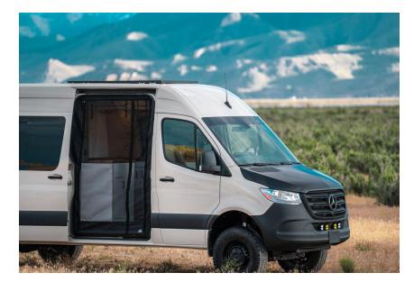
Slider Bug Screen