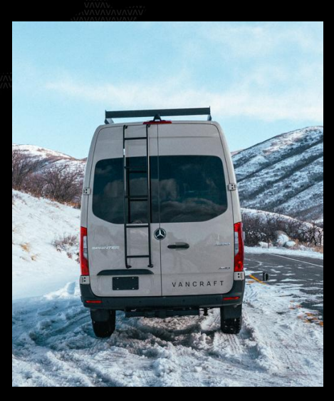
Rear door ladder and tow package; 5,000 lb tow rating.