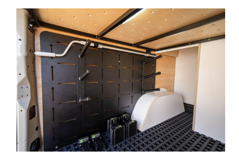
Pegboard Storage System