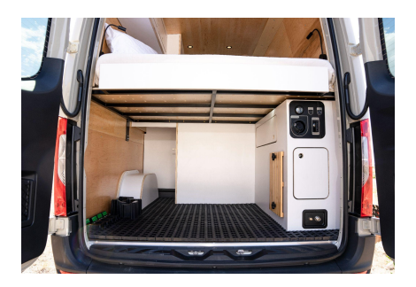
T-Mat Floor Storage System