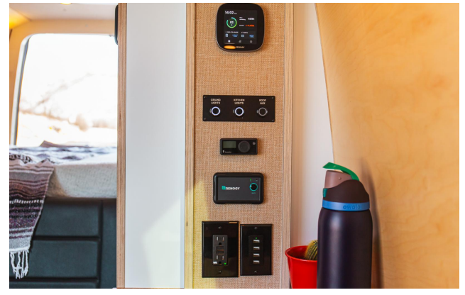
Advanced Tech Stack

We have eliminated all exterior holding tanks from our design, which means less maintenance and more fun.