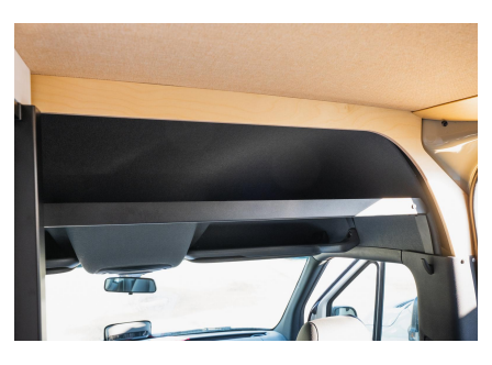
Cockpit Headliner Shelf