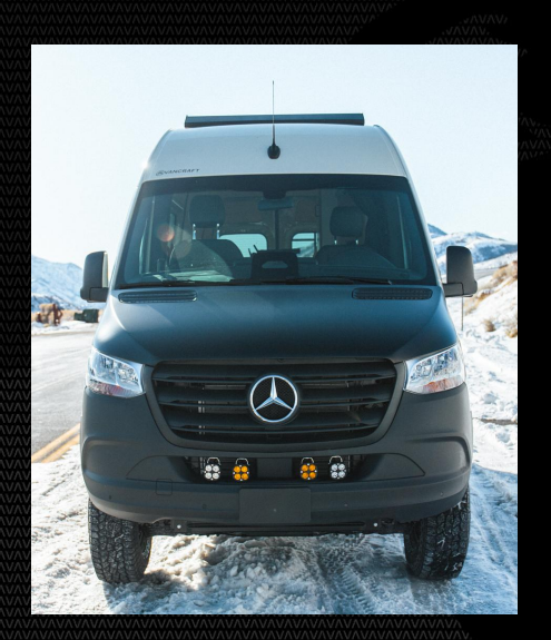
Protective matte black hood wrap and a two-tone light pod kit.