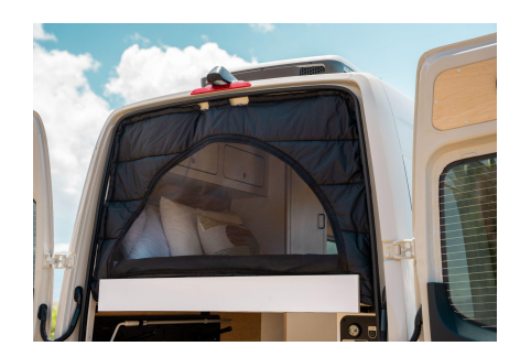
Rear Door Partition