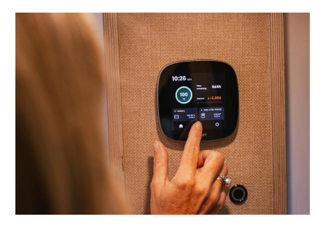
Battery Size Upgrade