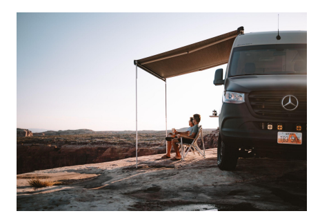
10" Fiamma Awning

Put Your Unique Touch On It Upgrade your Waypoint using our thoughtfully curated list of add-on options.