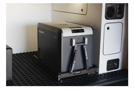
45L Dometic Garage Cooler