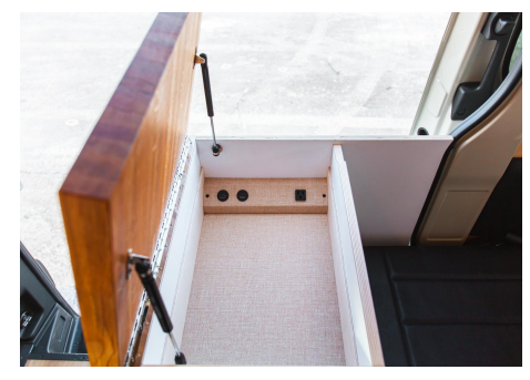
End table storage has been optimized for your electronics

Spacious closet and floor-ceiling pull out pantry.