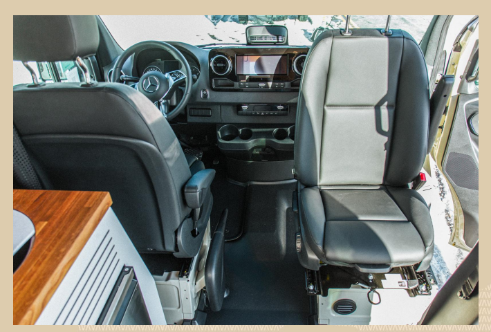
Passenger Seat Swivel

6-way adjustable table can be quickly removed and stowed in dedicated hideaway storage.