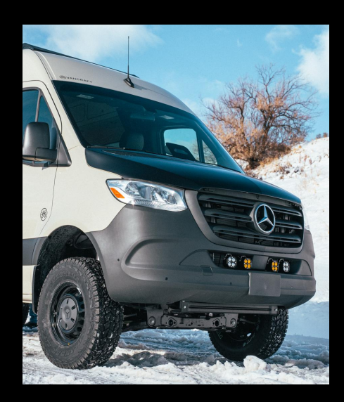
Matte black wheels wrapped in 32" all-terrain Yokohama tires.