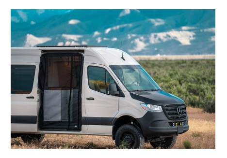
Slider Bug Screen