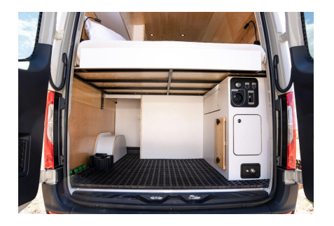
T-Mat Floor Storage System