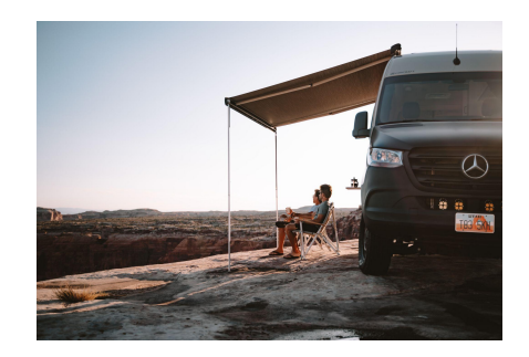
10" Fiamma Awning

Put Your Unique Touch On It Upgrade your Waypoint using our thoughtfully curated list of add-on options.