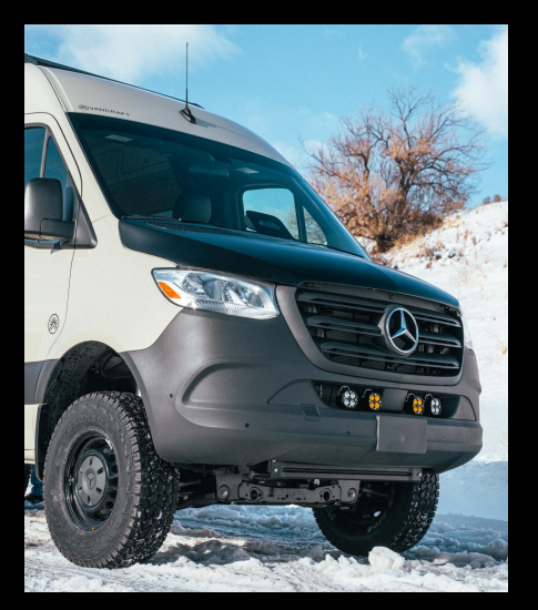
Matte black wheels wrapped in 32" all-terrain Yokohama tires.