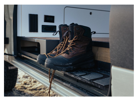
Every nook and cranny is optimized for gear storage