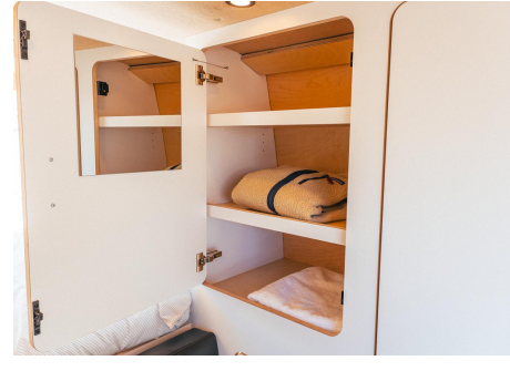
Compact and spacious closet with removable shelving system.