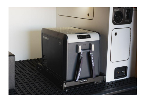
45L Dometic Garage Cooler