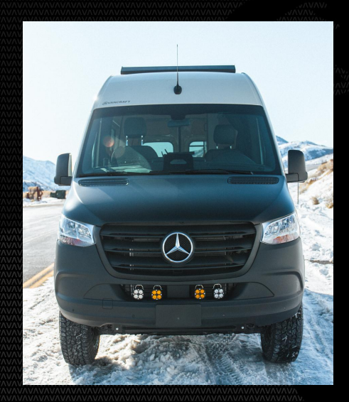
Protective matte black hood wrap and a two-tone light pod kit.