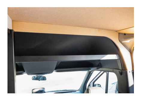
Cockpit Headliner Shelf