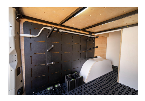
Pegboard Storage System