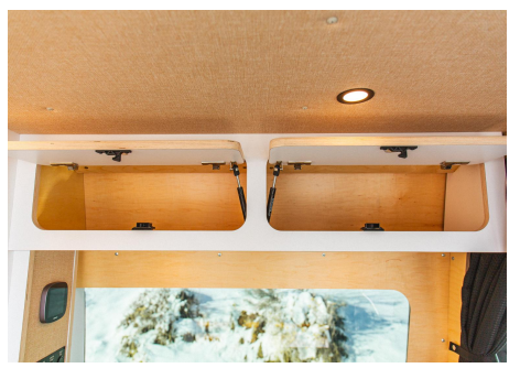
A total of four sleek and spacious overhead cabinets.