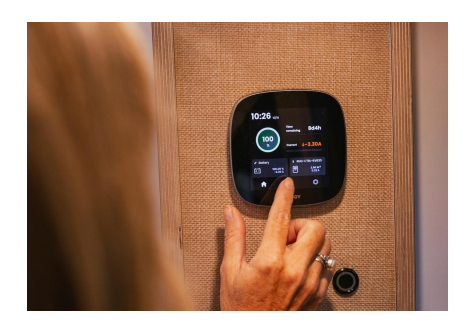
Battery Size Upgrade