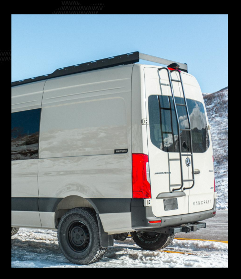
Rear door ladder and tow package; 5,000 lb tow rating.