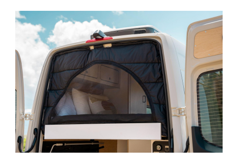
Rear Door Partition