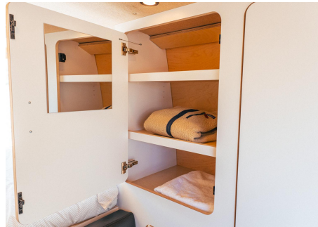
Compact and spacious closet with removable shelving system.