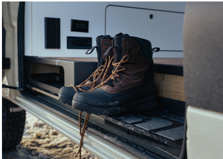
Every nook and cranny is optimized for gear storage