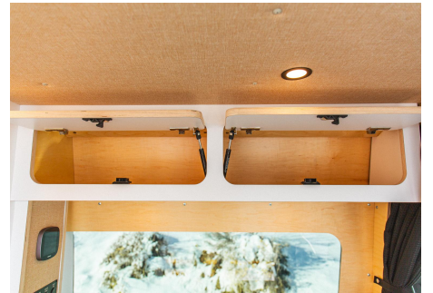
A total of four sleek and spacious overhead cabinets.