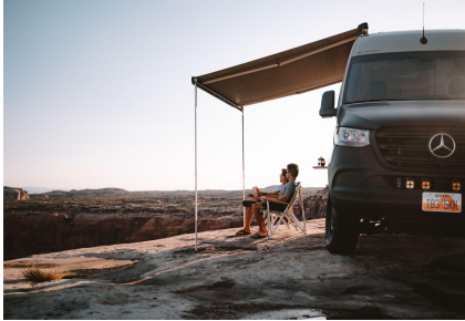
10" Fiamma Awning

Upgrade your Waypoint using our thoughtfully curated list of add-on options.