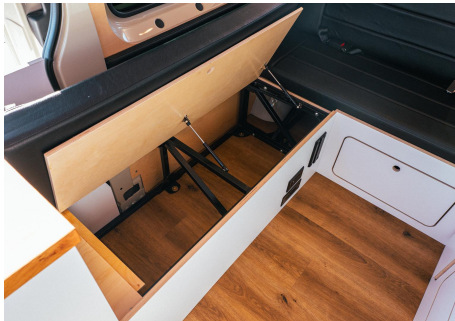
Cartridge toilet and gear storage under the bench seat.