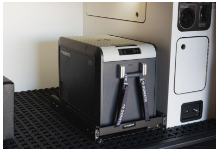
45L Dometic Garage Cooler