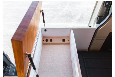
End table storage has been optimized for your electronics