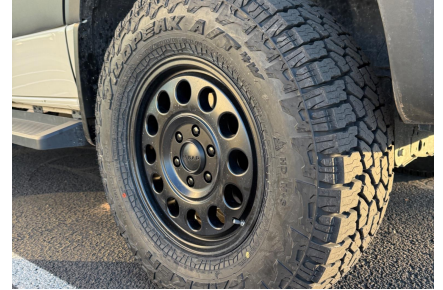
Off-Road Tire Package