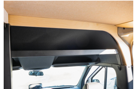
Cockpit Headliner Shelf